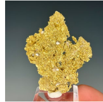
Gold (14.1g) Round Mountain Mine, Nye County, Nevada Kel Buchanan: $4500