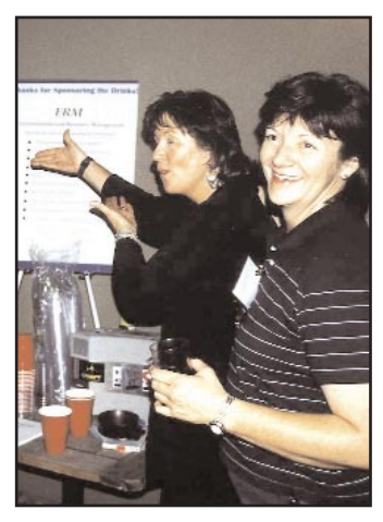
Stop 2. ERM sponsors the refreshments.