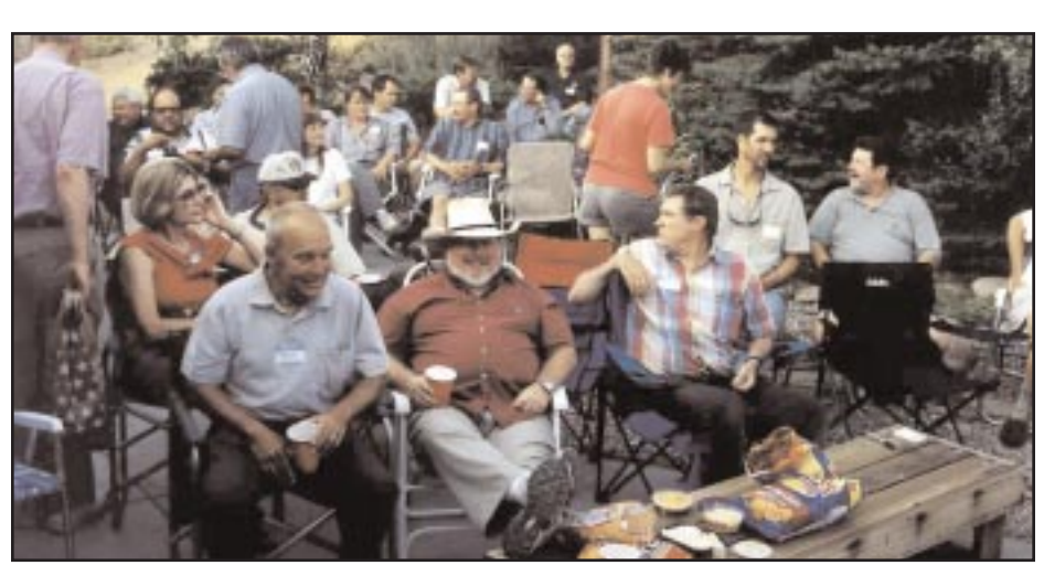
Stop 3. Sit back, prop your feet up, and enjoy the snacks!