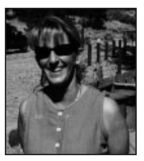
Thanks to Eklund Drilling Co. Inc. for hosting the October Meeting